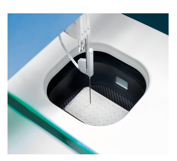
Access of pipetting tips to the shaking microtiter plate in the Riol ector®